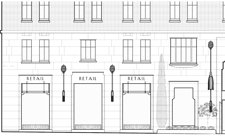
East 80th Street